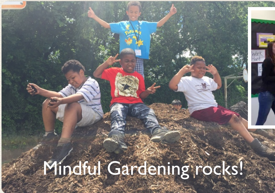
Mindful Gardening rocks!