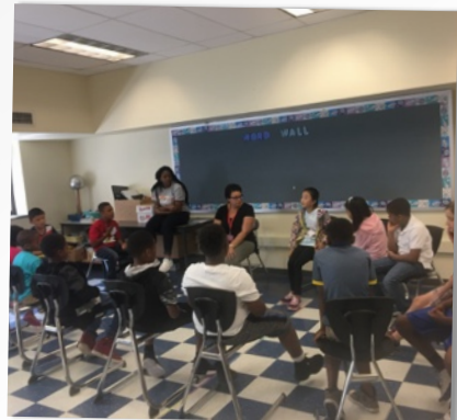
3RD GRADE ELA